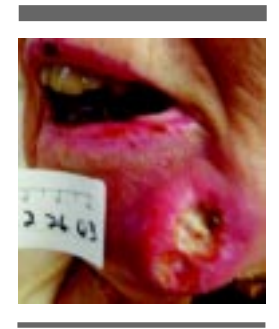
FIGURE 1. ORAL LESION PRIOR TO METRONIDAZOLE THERAPY

Head and neck-related cancers are a growing problem in the United States. In 2004, an estimated 28,260 Americans will be diagnosed with cancers of the oral cavity and pharynx and 7,230 will die from these diseases. Although more common among men, cancers of the head and neck do occur in women, and an estimated 9,710 women will be diagnosed with cancer of the mouth in 2004 (Jemal et al., 2004).