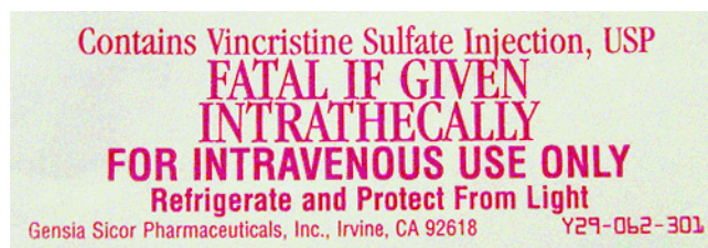
Figure 3. Example of Syringe Label That Is Affixed to Prepared Doses of Vincristine

In developing an institutional policy for intrathecal chemotherapy administration, several concepts warrant inclusion. First, chemotherapy of any kind should be given only