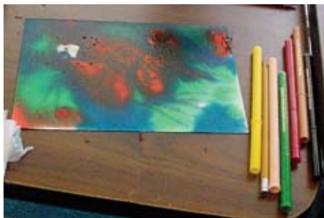
Figure 1. Monoprint Example

were held two to three times a month) with artist-interventionists recording numbers of people attending classes and details about attendees. Twenty family caregivers refused to participate in the research (average of one per session). Caregivers who refused and voluntarily stated reasons for not participating indicated that their refusals were related to salivary cortisol collection. Family caregivers who joined the class after it was in session on an impromptu basis did not participate in the AMC research protocol because consents had not been signed and the opportunity to complete pretests had passed. An average number of five participants attended each session, with an average of three family caregivers and an occasional patient, staff member from a nearby hospital, or visitor from the community. Graduate students who were interested in the research process occasionally attended the AMC as participant-observers. Outside family caregivers (those not staying in the facility) reported that they learned about the classes from flyers posted in the hospitals or by word of mouth. The 69 enrolled subjects were primarily female (80%); 38% were Hispanic, 23% were Islanders (Caribbean), and 20% were Caucasian. Caregivers were aged 18–81 years, with a mean of 48 years ( SD = 14.47 ). Two-thirds of the caregivers were daughters, wives, or mothers of patients (see Table 2).