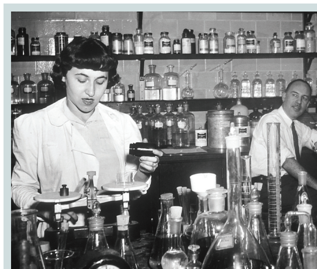
Figure 2. The Beginning of the National Cancer Institute's Chemotherapy Testing Program

Acknowledgment of the anguish and disfigurement associated with radical mastectomy inspired Jeanne C. Quint (1963) to more fully explore the impact of mastectomy. Quint was an early nurse researcher using qualitative methodology, mentored by Anselm Strauss in data