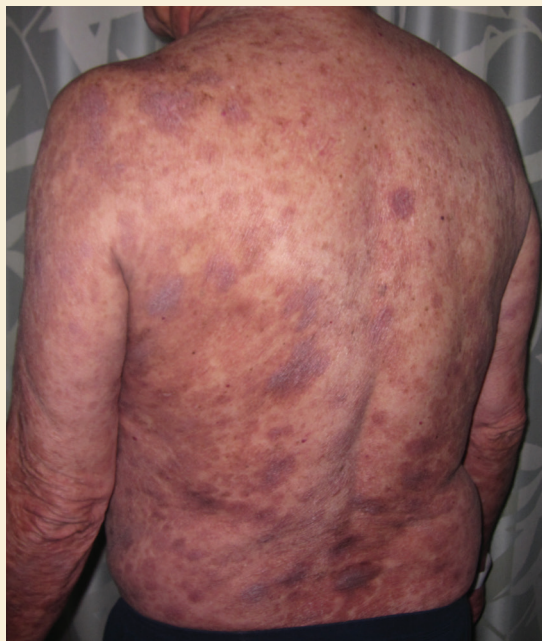
FIGURE 3. Case Study 3 Patient

Note. Photographs courtesy of Dana-Farber/Brigham and Women's Cancer Center. Used with permission.