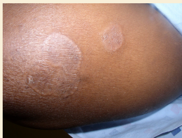
FIGURE 4. Case Study 4 Patient

In July 2011, the patient was diagnosed with MF-CTCL stage Ib (T2N0M0B0); a skin punch biopsy from a patch on her