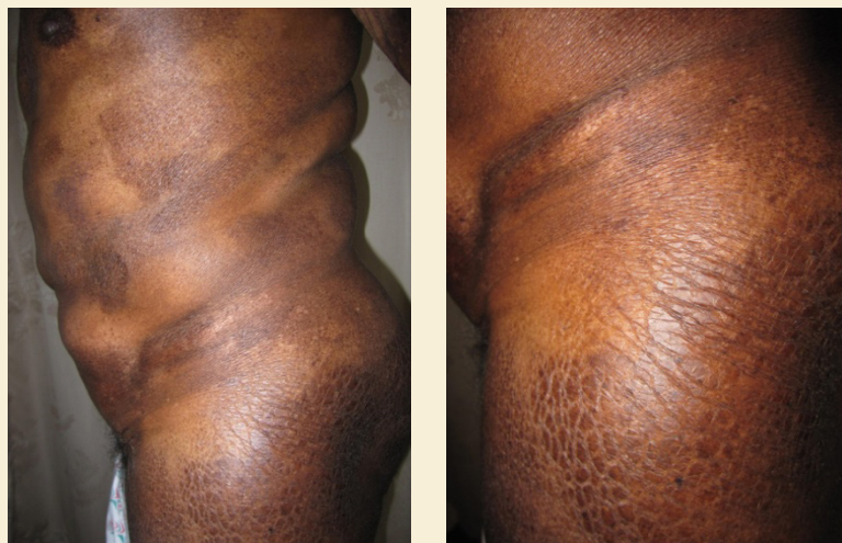
FIGURE 2. Case Study 2 Patient

Following the diagnosis, phototherapy was considered but was not a viable option because of geographic distance for the patient. Mechlorethamine gel was prescribed. Because of the previous dermatitis reaction following compounded mechlorethamine ointment use, the patient was instructed to patch test the mechlorethamine gel; the patient was instructed to