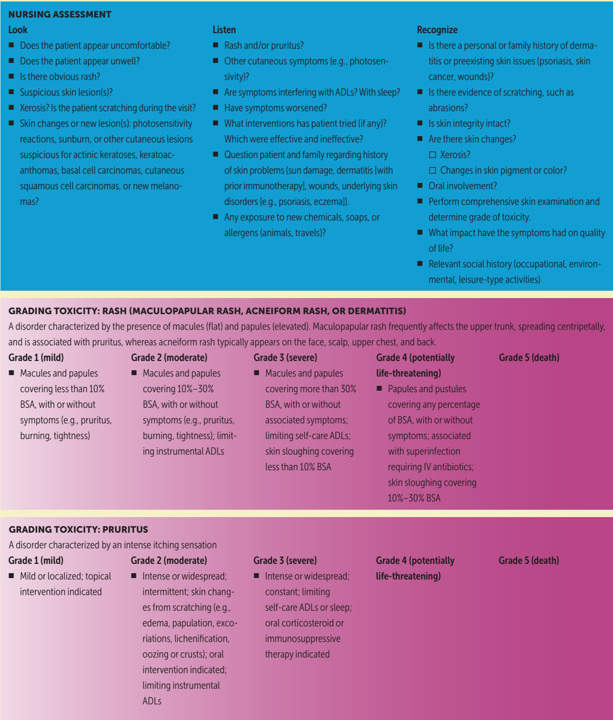
FIGURE 3. CARE STEP PATHWAY FOR MANAGEMENT OF SKIN TOXICITY