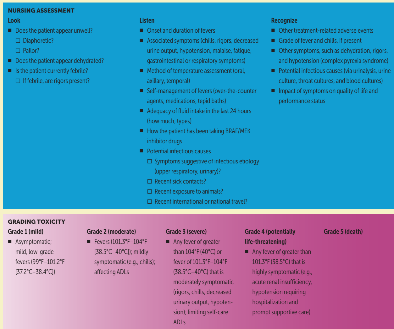
FIGURE 2. CARE STEP PATHWAY FOR MANAGEMENT OF PYREXIA: ELEVATED BODY TEMPERATURE IN THE ABSENCE OF CLINICAL OR MICROBIOLOGIC EVIDENCE OF INFECTION

ADLs—activities of daily living; BRAF—v-Raf murine sarcoma viral oncogene homolog B; MEK—mitogen-activated protein kinase kinase Note. Based on information from Atkinson et al., 2016; Genentech 2016, 2017; Lee et al., 2014; Menzies et al., 2015; National Cancer Institute, 2010; Novartis, 2016, 2017a. Note. Copyright 2017 by Melanoma Nursing Initiative. Used with permission.