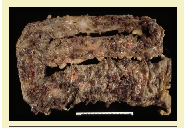
Note. This surgically resected bowel shows a "carpet of polyps," which is typically seen in familial adenomatous polyposis.