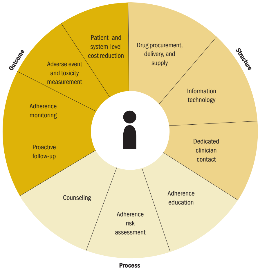
FIGURE 2. Scoping Review Model

This scoping review identified 20 distinct OAM programs reported in the literature, which included an aggregate of 10 components aimed at improving patient adherence. The programs included