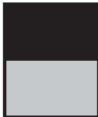
1/2 Page • Horizontal